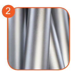
Solid construction made of stainless steel AISI 304 totally resistant to weather conditions.