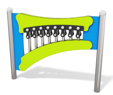
Xylophone module, made of 13mm HPL plate and anodized aluminium. Allows you to play C- major scale.