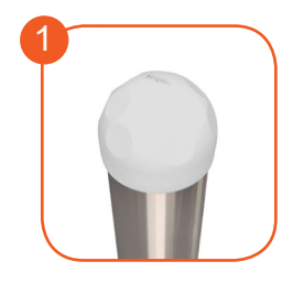
Safe pipe plugs made of injection molded polyamide.

Rotary module, which allows to move the ball in the maze, made of HDPE plate, safe polycarbonate and stainless steel.